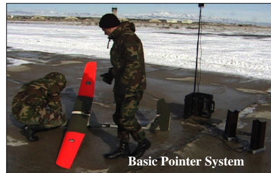
Basic Pointer System

For additional information please contact: Martyn Cowley, AeroVironment Inc.