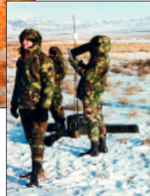
Pointer Operating at Below Freezing Conditions at Mountain Home AFB , ID, February, 2001