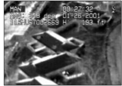
Night Vision Exercise at George AFB , February, 2001