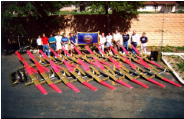
Pointer Team with TQM Flag awarded in 1991 Over 120 aircraft have been built to date

The Pointer UAV is a low-cost UAV System. Pointer can be hand-launched and recovered in minutes without special equipment on unprepared terrain. All airborne and ground equipment fit into 3 lightweight, man-portable, containers.