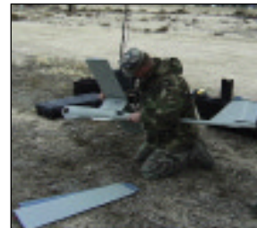
Pointer Demo at George AFB, February, 2001